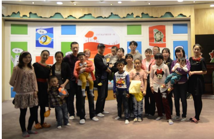
CRPD workshop for visually impaired parents with their children in Shenyang