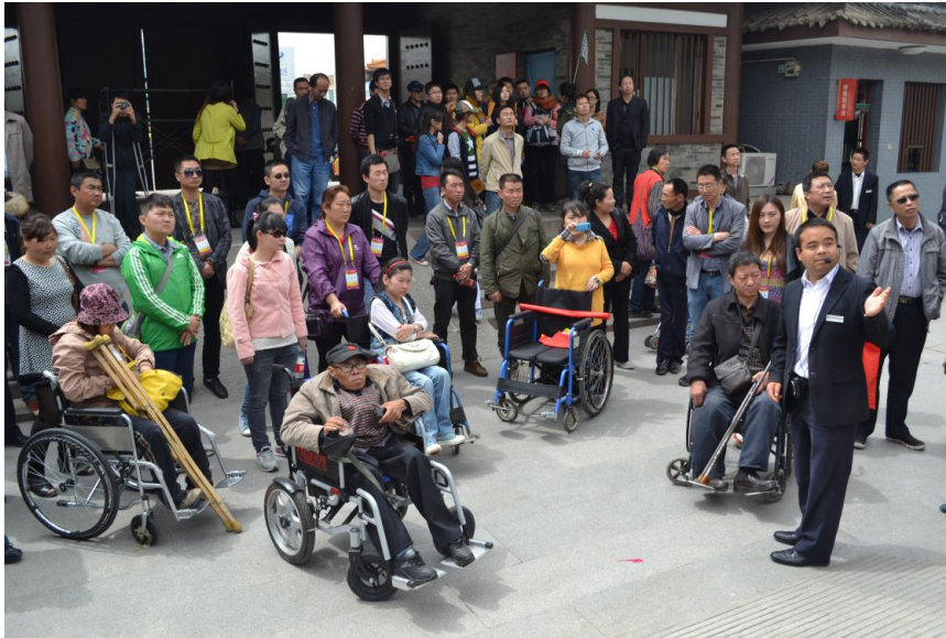
Participants in the outing to Famen Temple