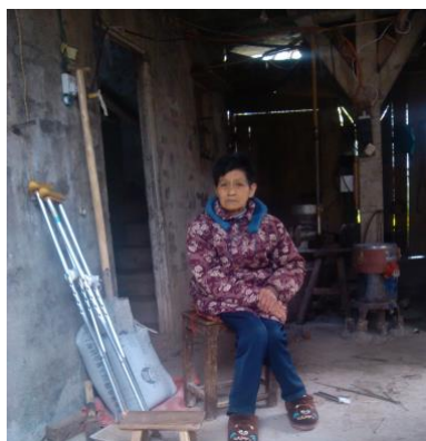
A villager from Xiong Su's village

Talking again about sustainability, sustainable integration. This was in the follow-up phase of the interviews. The method was to give participants 200 yuan to spend on a specified amount of goods at the non-staples food store. They were allowed to choose to spend this either on items for daily use or food during a 20-day period. Each time they were allowed to spend between 10 and 30 yuan and would have to sign their name. Apart from making a small improvement to their standard of living, I hoped to provide disabled people with a reason for leaving their homes and I offered a venue where they would have the opportunity to meet people. There is not much fun going on in the countryside. Generally speaking, going out means buying some daily items or pickles or something at the shop. The central collection and distribution centre would meet these needs exactly and at the same time the questionnaires could be distributed, achieving two goals simultaneously.